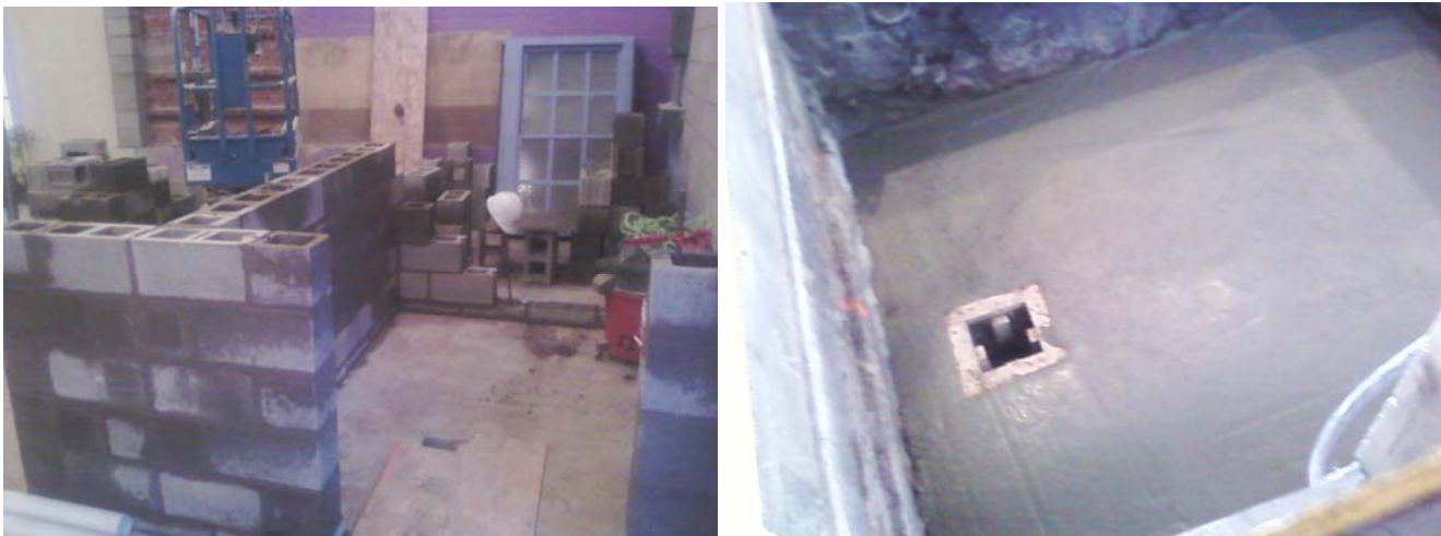
Mechanical Room walls and elevator pit poured floor

Ideal Metal Works started hanging the new heating duct work in Fellowship Hall. They plan to tie the new duct work into the old system prior to the arrival of the new HVAC units that will be located on the roof of the Sunday school addition. The Masonry workers started building the new walls that will enclose the new elevator control room and the mechanical room. The new location for these two rooms is where the old pre-school area is now. The plumbers moved some of the gas lines that are presently running Fellowship Hall to be able to support the new HVAC roof units. They also continued to work on the hot water supply to the front restrooms along with the required drains and venting. The Cement people were here today to pour the floor in the pit of the new elevator. They also covered the plumbing for the new restroom area that the inspector passed last Friday.